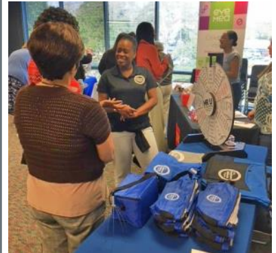
NSU Tampa employees playing health games.