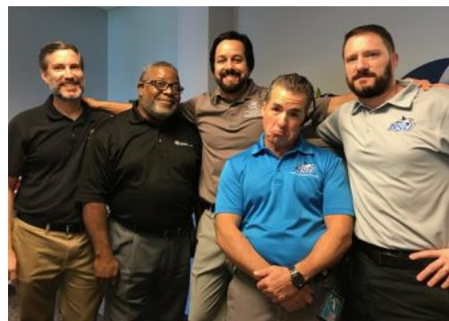
The last day of No-Shave November