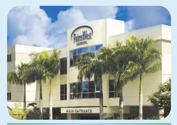
PALMS WEST HOSPITAL