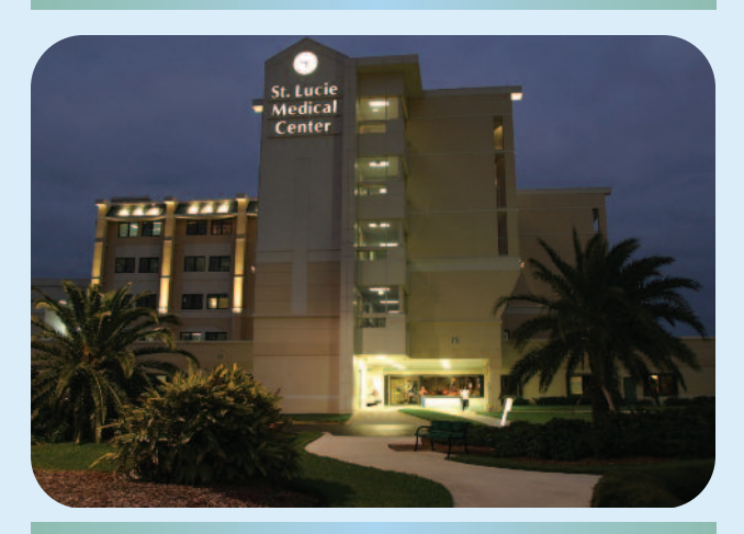
ST. LUCIE MEDICAL CENTER