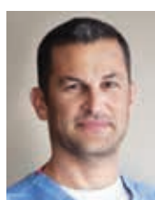
perioperative transesophageal echocardiography. He then joined forces with Brevard An-