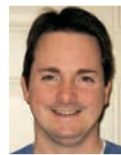
the Carnegie Mellon Heinz College of Business Master of Medical Management Program,