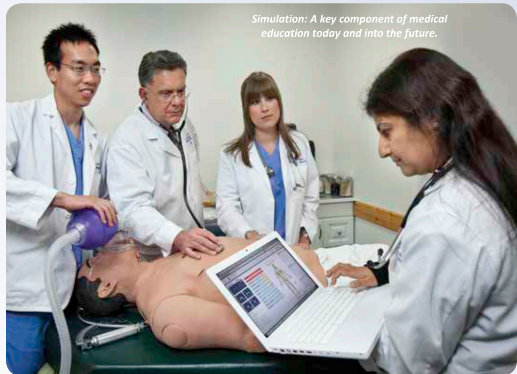
Simulation: A key component of medical education today and into the future.

D evelopment of dual-degree programs and articulation agreements with selected premed programs