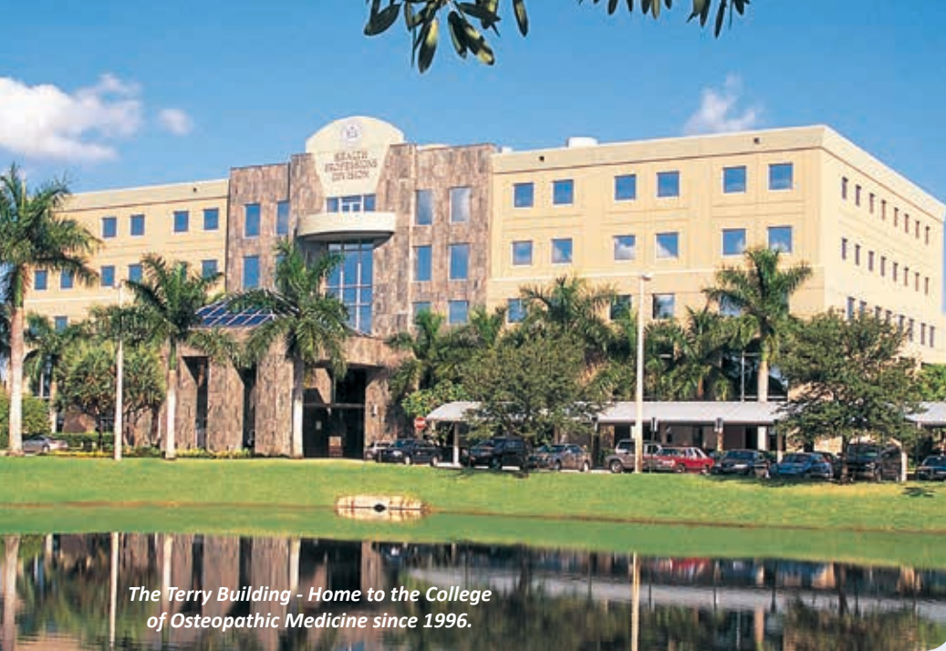
The Terry Building - Home to the College of Osteopathic Medicine since 1996.

contemporary education model with Matthew Terry, D.O. (1991-1997) were the results of the total effort and dedication of all involved with the institution during their tenures.”