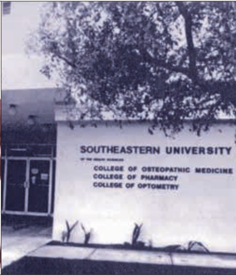
First Building on Las Olas Blvd.....Inaugural Class of Ph.D. Students.....Southeastern University in the 1980s

versity, a paradigm of educational excellence called the NSU Health Professions Division officially opened on June 22, 1996—and the accolades have been accruing ever since.