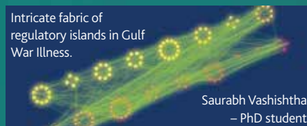
Intricate fabric of regulatory islands in Gulf War Illness.

Both groups, though suffering from illnesses with very different causes and intracellular behavioural characteristics, are linked by chronic dysfunction of the hypothalamic-pituitary-adrenal (HPA) axis. To restore the HPA axis to its natural homeostatic rest point, conventional treatments have focused unsuccessfully on replacement therapies to address the altered levels of sex and stress hormones observed in patients. The failure of these time-invariable and single agent treatments suggests that the body's response to this dysfunction is to implement a new stable regulatory programme that promotes natural resistance to replacement therapies. In early proof-of-concept work, Broderick and Craddock proposed a treatment strategy that reduces the bioavailability of cortisol, a hormone that modulates immune functions, instead of increasing it. "We can apply dynamic control theory to design time-dependent treatment courses that exploit the body's own regulatory drive," Broderick explains. Delivered according to an optimal treatment schedule, the HPA axis overcompensates for the sudden reduction in cortisol, causing it to reset itself to the correct regulatory regime and back to its natural homeostatic rest point. Continued development of these models is reinforcing the notion that such reprogramming may require a two-pronged attack, namely the coordinated use of both immune and endocrine modulators.