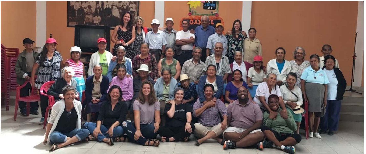
NSU STUDENTS AT VILCABAMBA SENIOR CENTER