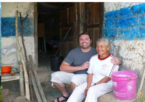
STUDENT WITH SMALL FARMER