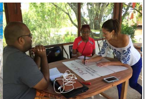
RESEARCHERS AT WORK