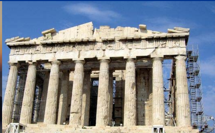
The Parthenon in Athens