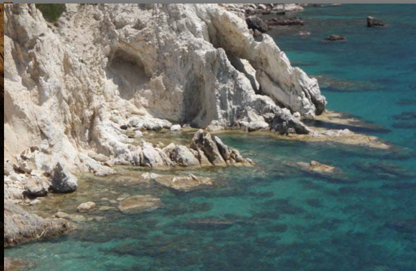
Vourlidia in Chios