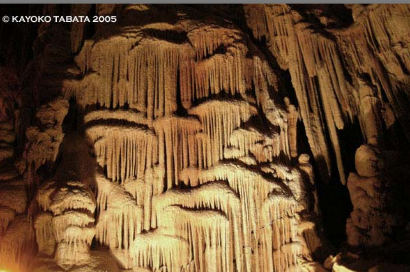
Cave in Olympi, Chios