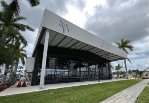
Superyacht Pavilion at Pier 66 South