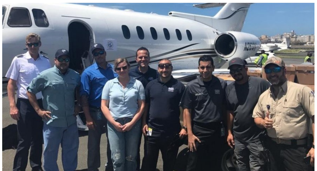
Plane crew and NSU Puerto Rico Regional Campus security staff

997 San Roberto Street San Juan, Puerto Rico 00926