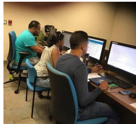
Students working on assignments.