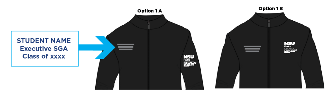
Option 1 A and B = two locations set up with college logo (stack version) on the sleeve OR on the opposite side