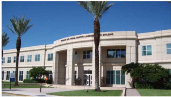
Horvitz Administration Building

The One-Stop Shops (OSS) are conveniently located on the main campus at two locations: