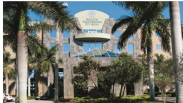
Terry Administration Building