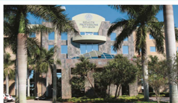
Terry Administration Building