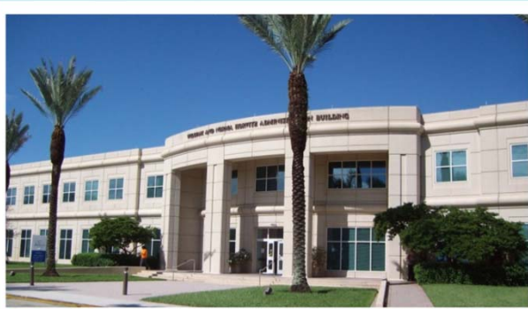
Horvitz Administration Building