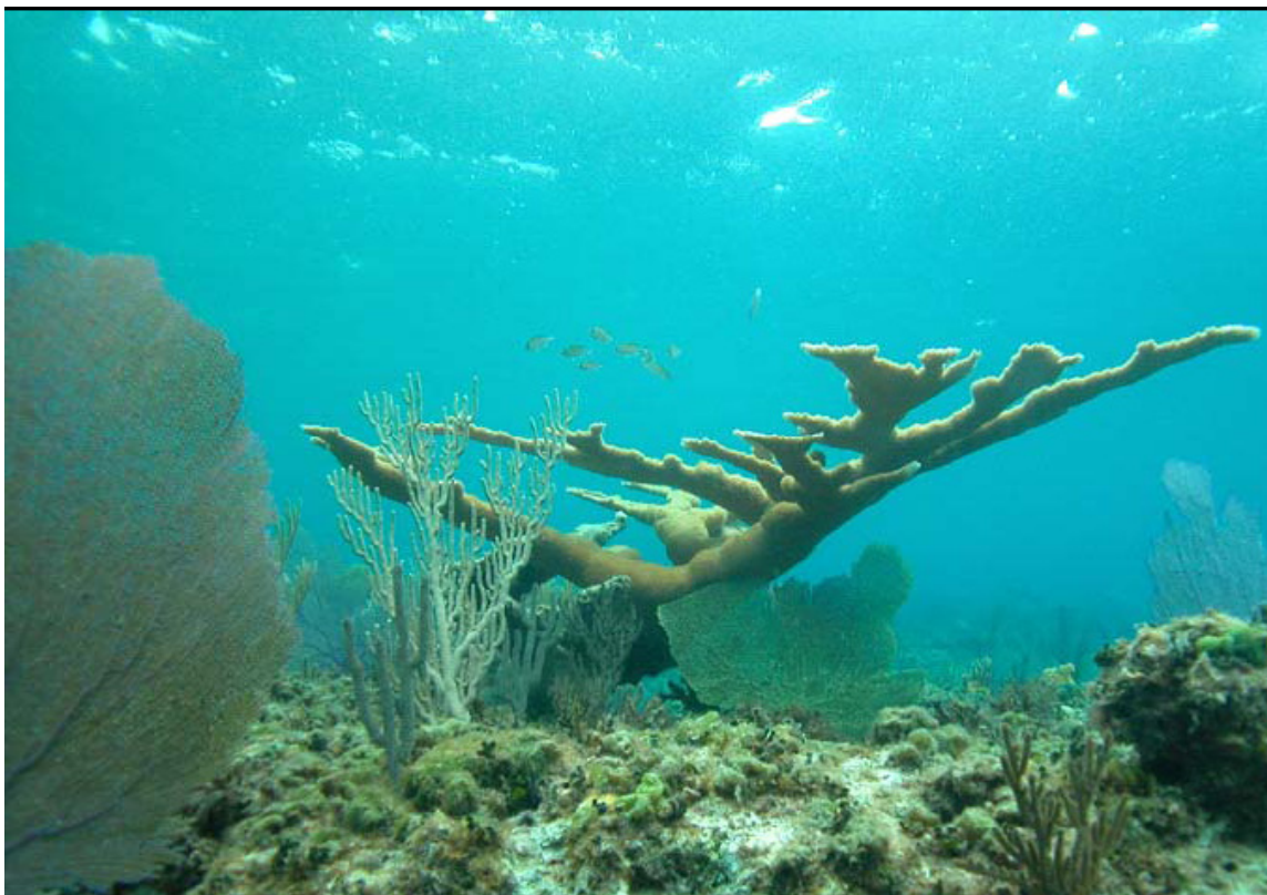
Section of the Andros barrier with large Acropora colony (K. Marks)

populations of Acropora coral left in the Caribbean, although disease and predation continues to take a toll. Fish populations in these shallow reef crests areas are very high. B) Fore reefs: We will dive on the shallow fore reef where head corals form a nearly continuous carpet dominated by Montastraea annularis . The low wave energy setting in central south Andros allows the development of coral pinnacles up to 5 m high in places. Extensive coral bleaching and disease have caused major losses to these reefs during the past decade and algal overgrowth is high. The endangered Nassau grouper occurs in high abundance on Andros fore reefs.