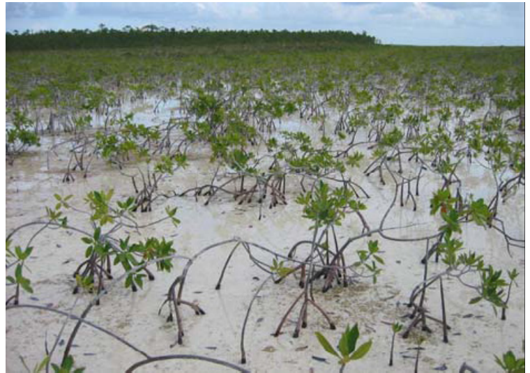
Peritidal mud flats with cemented dolomite crusts and dwarf mangrove communities (R. Ginsburg and P. Kramer).

14 July (Day 3): Joulter Cays - contemporary ooids, submarine and vadose cementation, beach rock, hurricane layers. Depart by bus at 8:00 am to a North Andros marina where we will board small boats for a 1 hour trip north to the Joulter Cays. Joulter Cay ooid sand shoals provide an unparalleled experience to see and sample contemporary ooids forming on shallow banks and accumulating on beaches and peritidal flats. Examples of submarine and vadose cementation and the remarkable preservation of subtidal hurricane layers. Lunch provided. Snorkel gear and wading shoes.