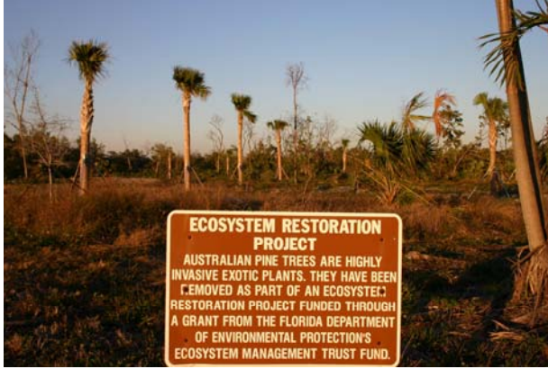
Ecosystem Restoration area