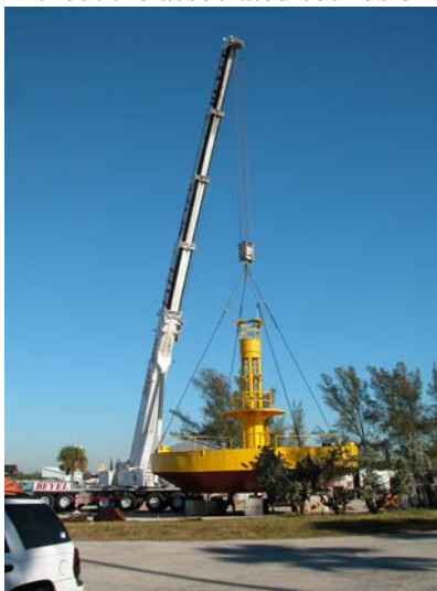
Crane moving buoy to the water.

MS Student, Bill Baxley , lead engineer at the South Florida Testing Facility, located adjacent to the Oceanographic Center at Port Everglades, recently directed the installation of a 50 ft diameter, 200,000 pound submarine mooring buoy in South Tongue of the Ocean (STOTO), Bahamas. The large buoy, which has sat at the SFTF Facility since 2003, was refurbished, repainted, and fitted with a variety of electronic systems, including a satellite GPS tracking system and solar power system. The buoy is used for the measurement of submarine noises at STOTO, and is part of the Navy's ship silencing program. The buoy has a 10 year lifespan, and is designed to survive hurricanes and other adverse weather conditions. Installed in 4500 ft of water, the buoy uses 2 5/8" mooring line and over 80,000 pounds of chain and anchor to hold it in place. The buoy allows for a very quiet platform to listen to submarines, without the associated sounds of a ship or other vessel.