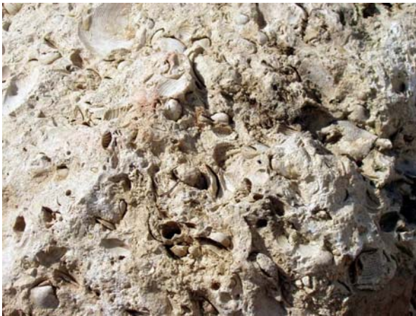
Close up view of boulder showing fossil shells.