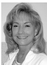
1st Quarter Winner