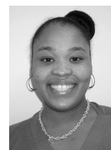
3rd Quarter Winner